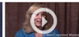
PRK And Recovery