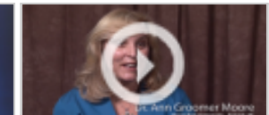
PRK And Recovery