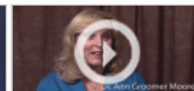
PRK And Recovery