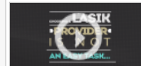
How To Choose A LASIK Provider