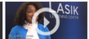
The Difference Between LASIK and PRK