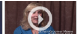
PRK And Recovery